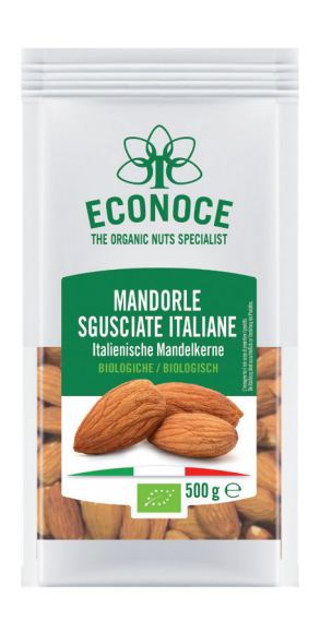
SHELLED ALMONDS 150g - 500g