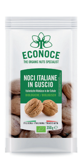
IN SHELL CHANDLER WALNUTS 350 g - 5 kg

THE RESULT OF A PROJECT RUN BY OUR COMPANY AND THE WALNUT GROWERS OF THE PO DELTA. THE ANCIENT KNOWLEDGE OF THE FARMERS WHO HAVE BEEN WORKING THESE LANDS FOR GENERATIONS, THE CHOICE OF THE CHANDLER VARIETY, AND THE RESPECT WE HAVE FOR NATURE ARE RESPONSIBLE FOR THIS FRAGRANT, BUTTERY, AND RICH ITALIAN WALNUT, AS UNIQUE AS THE PLACE WHERE IT GROWS.