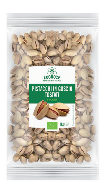
ROASTED IN SHELL PISTACHIOS 1Kg