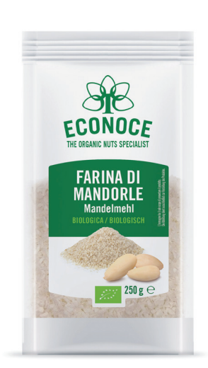
ALMOND FLOUR 250g