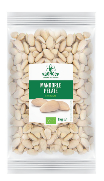
BLANCHED ALMONDS 1Kg