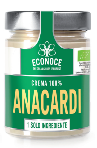
\begin{array}{c} \textbf{100\% CASHEW SPREAD} \\ \textbf{300g} \end{array}