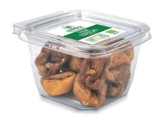
DRIED FIGS 250g