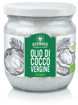
VIRGIN COCONUT OIL 400g