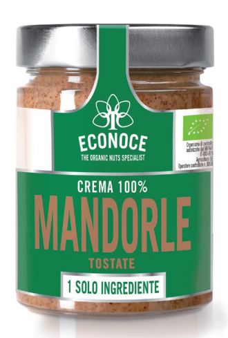
100% BROWN ALMOND SPREAD 300g