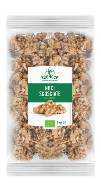
SHELLED WALNUTS 1Kg