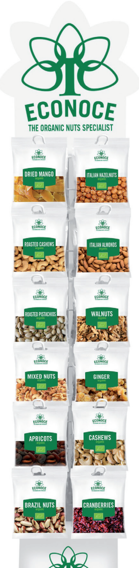
Display 12 hooks