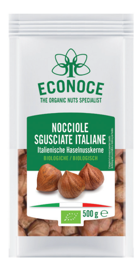
SHELLED HAZELNUTS 150g - 500g