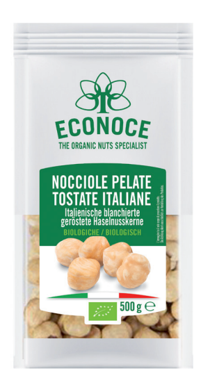
ROASTED PEELED HAZELNUTS 150g - 500g