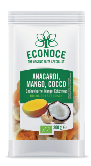
CASHEWS - MANGO -COCONUT MIX 200g