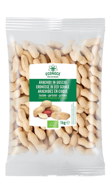
ROASTED IN SHELL PEANUTS 1Kg