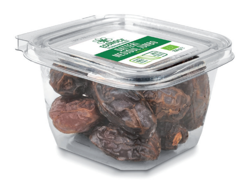
MEDJOUL DATES 250g