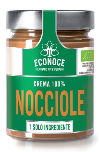
100% HAZELNUT SPREAD 300g