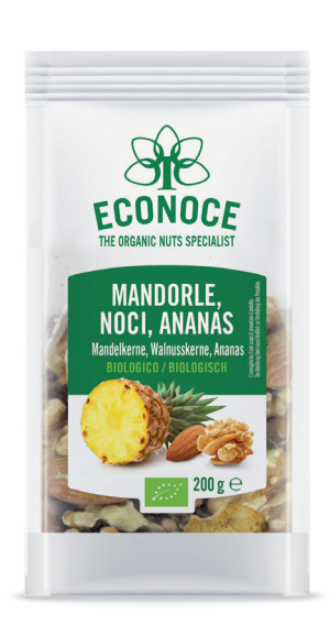
ALMONDS - WALNUTS -PINEAPPLE MIX 200g