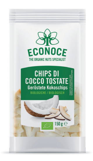
ROASTED COCONUT CHIPS 150g