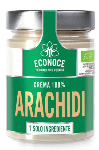
100% PEANUT SPREAD 300g