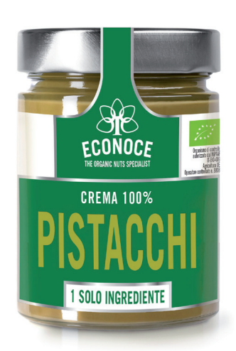
100% PISTACHIO SPREAD 300g