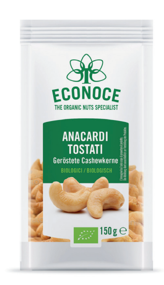
ROASTED CASHEWS 150g