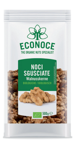
SHELLED WALNUTS 150g - 500g