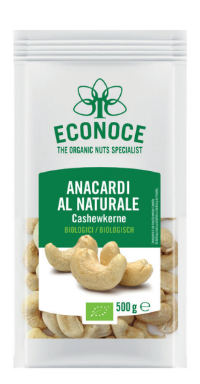
CASHEWS 200g - 500g