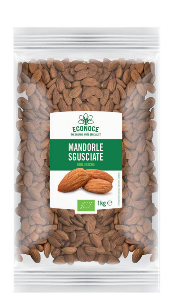
SHELLED ALMONDS 1Kg