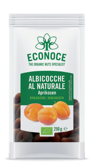
DRIED APRICOTS 250g