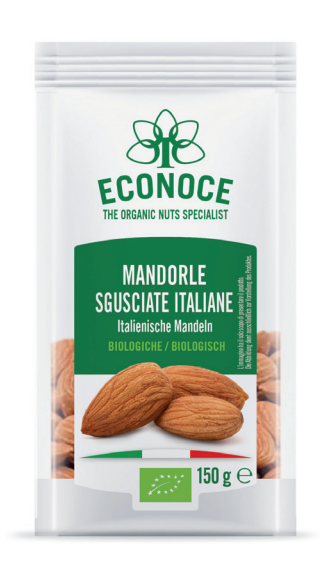
\begin{array}{c} \textbf{ROASTED SHELLED ALMONDS} \\ \textbf{150g} \end{array}