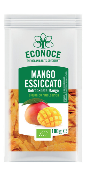
DRIED MANGO 100g