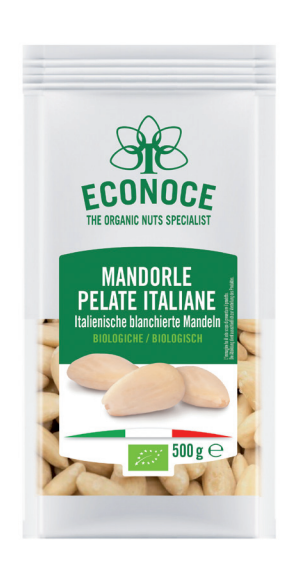
BLANCHED ALMONDS 150g - 500g