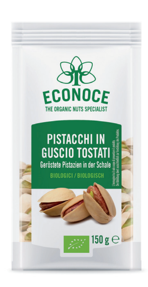
ROASTED IN SHELL PISTACHIOS 150g