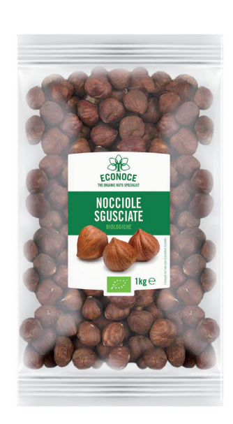
SHELLED HAZELNUTS 1Kg