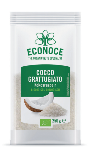
\begin{array}{c} \textbf{DESSICCATED COCONUT} \\ & 250 \text{g} \end{array}