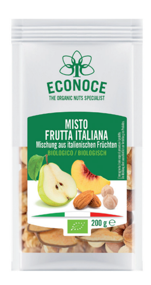
ITALIAN FRUIT&NUTS MIX 200g