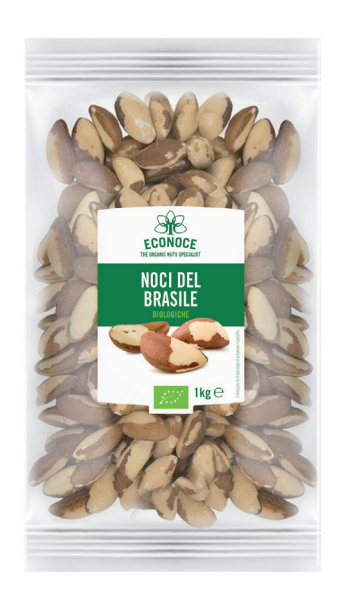
BRAZIL NUTS 1Kg