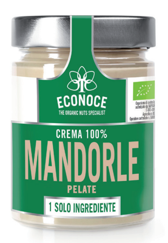
\begin{array}{c} 100\% \text{ WHITE ALMOND SPREAD} \\ 300g \end{array}