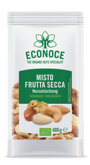
NUTS MIX 400g