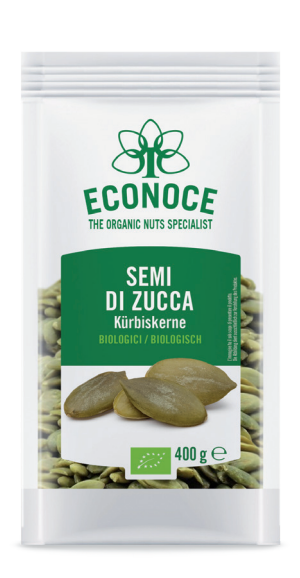
PUMPKIN SEEDS 400g