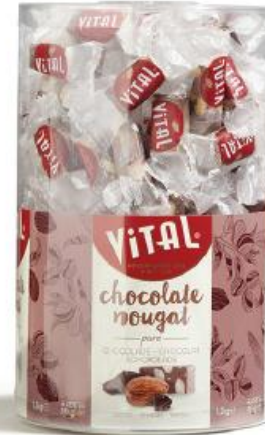
Chocolate Tub / 6 x 1,2 kg Art. 10603