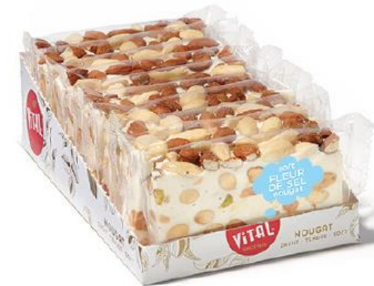
Fleur de sel 10 x 100g Art. 21150