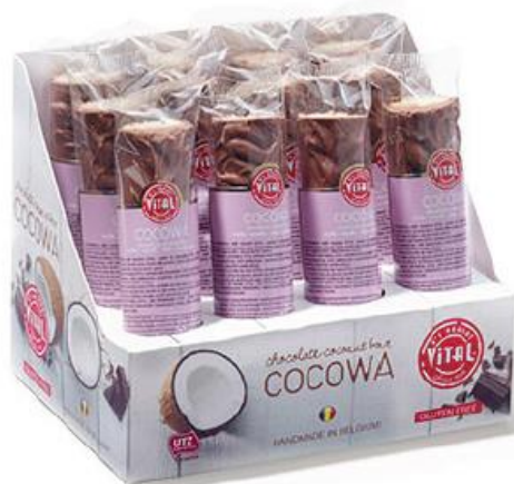
Coconut & Milk chocolate 4 x 12 X 80g Art. 30001M