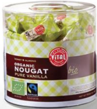
Almond tub / 6x700g Art. 27520