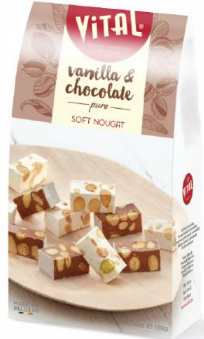
Vanilla & Chocolate 14 x 150g Art. 18 00 2