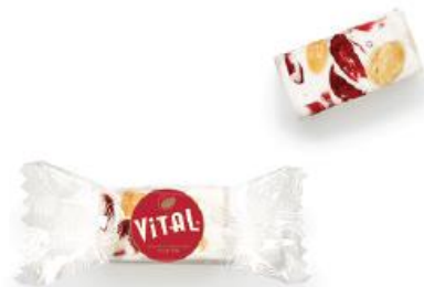
Cranberry Bulk case / 2 kg Art. 10002K