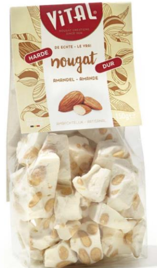
Hard almond nougat 10 x 150g Art. 01100