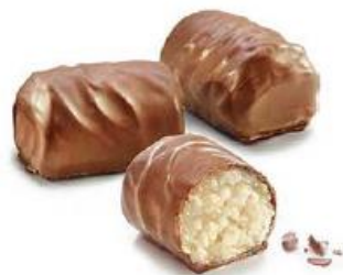
Coconut Pure 3 kg / bulk case Art. 30002K