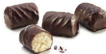
Coconut Rhum 3 kg / bulk case Art. 30002R