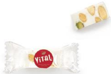
28% Almond, 2% Pistachio Bulk case / 2 kg Art. 10002A