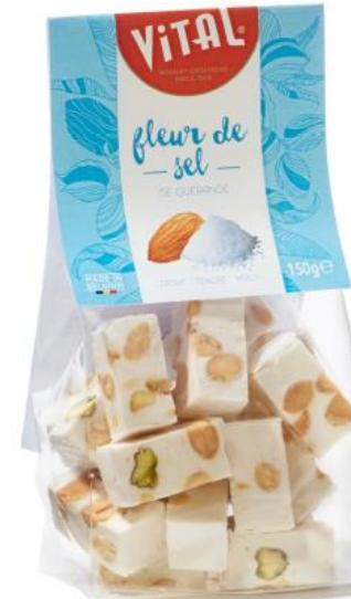
Fleur de sel 10 x 150g Art. 01003