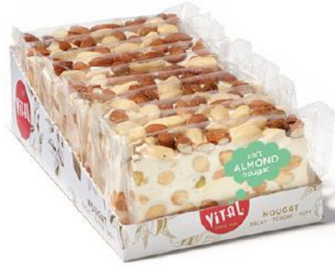
Almond 10 x 100g Art. 21100

What you see is what you get: only the best.