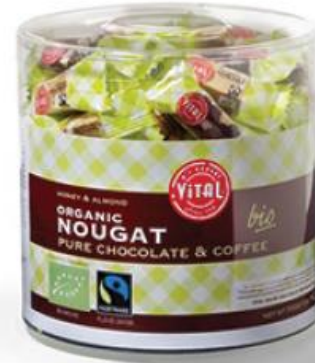
Chocolate & Coffee tub / 6x700g Art. 27530