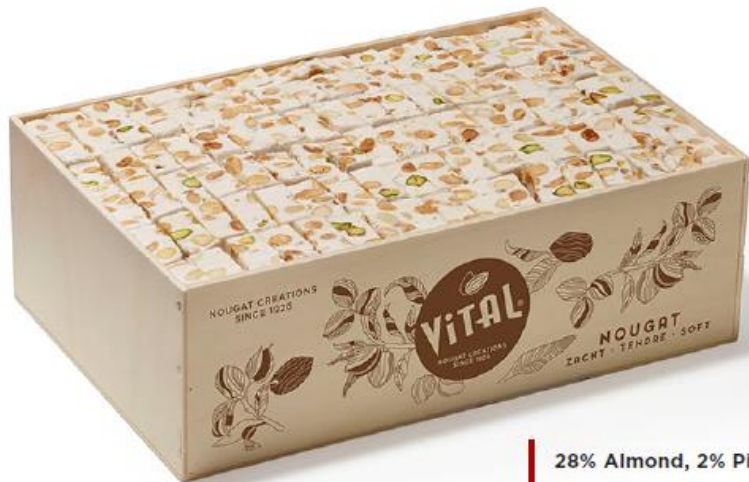
28% Almond, 2% Pistachio 5kg / wooden box Art. 10002