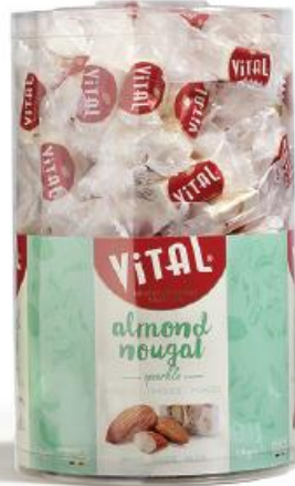
28% Almond, 2% Pistachio Tub / 6 x 1,2 kg Art. 10601

The perfect companion of the afternoon tea or coffee For pick & mix sales