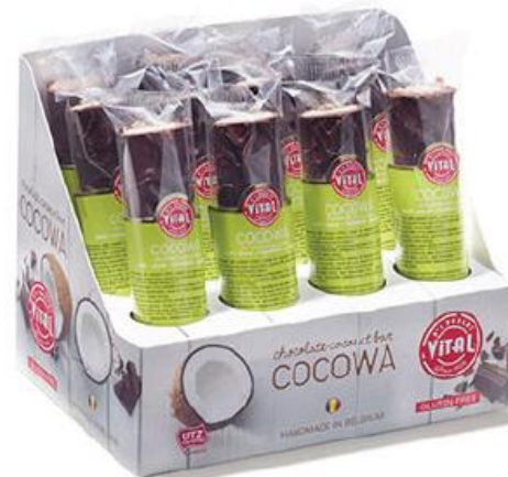
Coconut & Dark chocolate 4 x 12 X 80g Art. 30001F