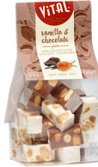
Vanilla & Chocolate 10 x 150g Art. 01002