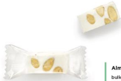
Almond, neutral bulk case / 2 kg Art. 27200

The original recipe from 1926, re-invented: organic, and made with fair trade cane sugar, honey, cocoa and coffee. Delicious, soft, non sticky and less sweet.