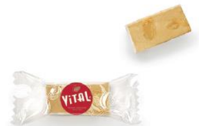
Cappuccino Bulk case / 2 kg Art. 10002M