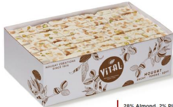
28% Almond, 2% Pistachio 4x2,5kg / display Art. 1000200