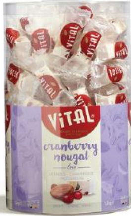
Cranberry Tub / 6 x 1,2 kg Art. 10602