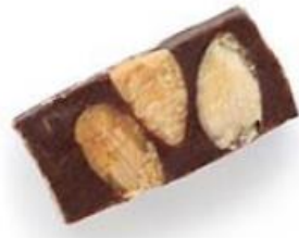
Chocolate 6kg / bulk case Art. 100021