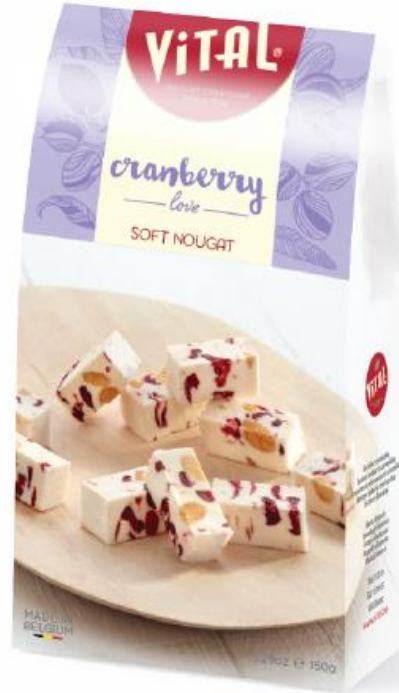
Cranberry 14 x 150g Art. 18 00 1