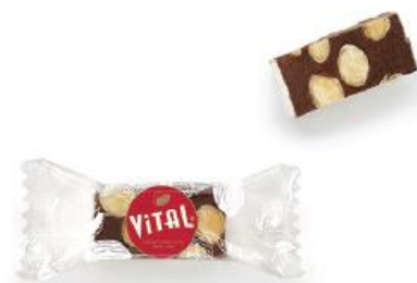
Chocolate Bulk case / 2 kg Art. 10002C