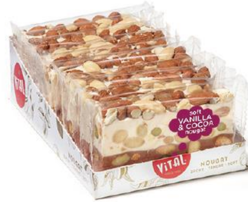
Vanilla & Cocoa 10 x 100g Art. 21110