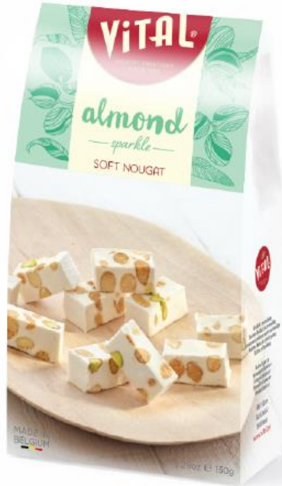
Almond & Pistachio 14 x 150g Art. 18 00 0

Contains individually flowpacked nougats