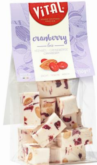
Cranberry 10 x 150g Art. 01001