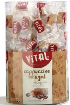
Cappuccino Tub / 6 x 1,2 kg Art. 10604