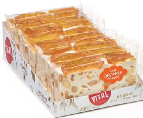
Orange 10 x 100g Art. 21130