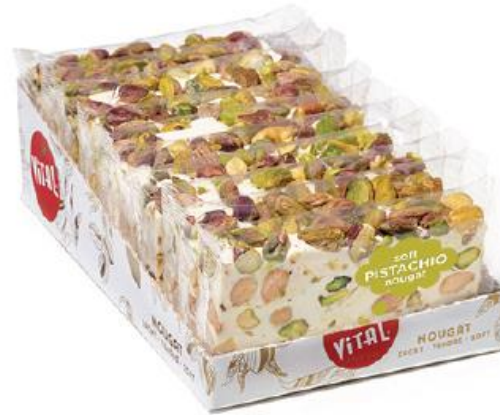
Pistachio 10 x 100g Art. 21140