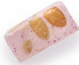
Strawberry 5kg / bulk case Art. 10002254