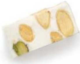
28% Almond, 2% Pistachio 5kg / bulk case Art. 100020

Zero plastic waste To repack and sell as bulk