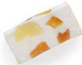
Papaya & Pineapple 6kg / bulk case Art. 100022