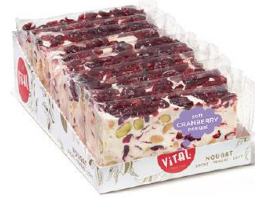
Cranberry 10 x 100g Art. 21120