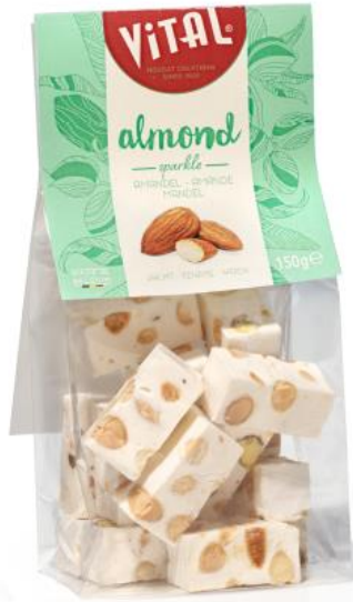
Almond & Pistachio 10 x 150g Art. 01000

Pre-cut and packed, perfect for the afternoon tea, or with the coffee-on-the-job. Available in private label, at low minimum order quantities.