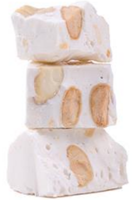
Crunchy 3kg / bucket Art. 11003